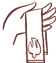
Holy Orders (Ordination)