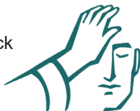
Anointing of the Sick (Last Rites)